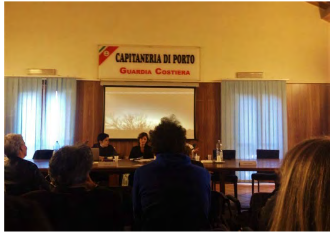
(Third session of the conference at the Coast Guard headquarters)